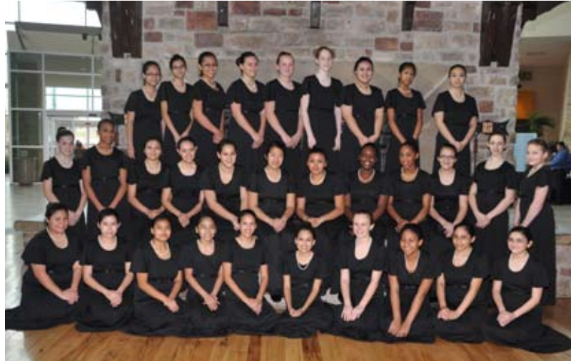
Funds contributed by SBEF helped the Spring Oaks Middle School choir travel to Washington, D.C. to perform.