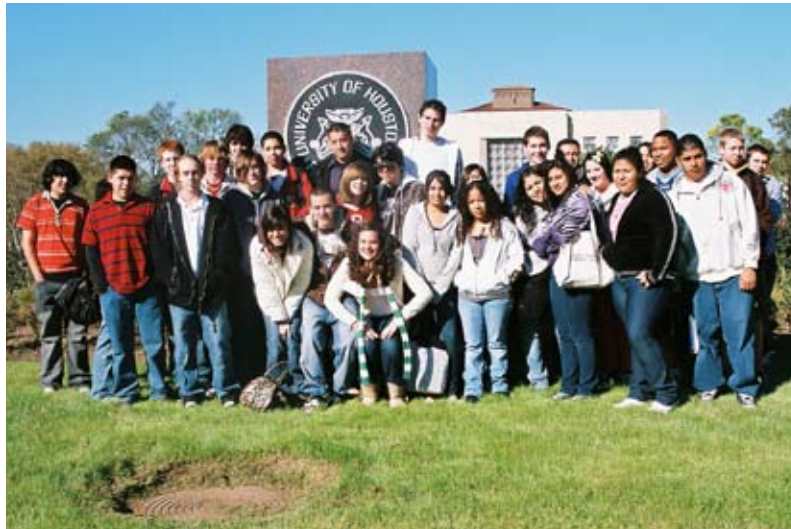
Westchester Academy for International Studies students took advantage of a J. Landon Short Mini-Grant to visit the University of Houston as part of the "Believe It - Achieve It" program to encourage higher education.