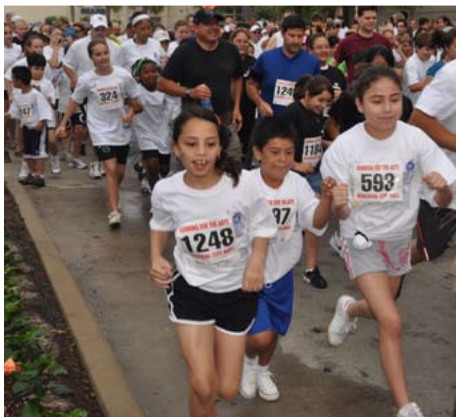
Kids of all ages begin the Kids K run.