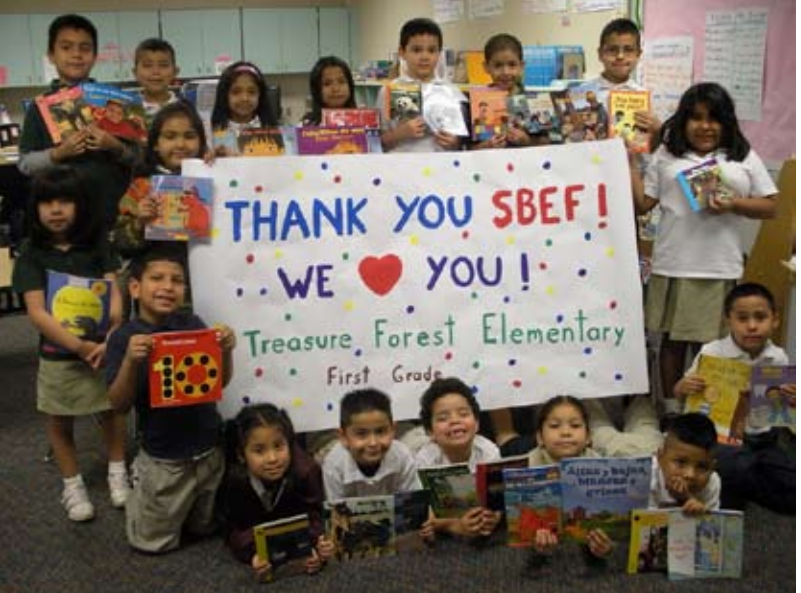
First-graders at Treasure Forest Elementary offered a huge thank you to SBEF for a grant that provided a Free Voluntary Reading Program. Access to 949 new titles that could be read in the classroom and taken home increased the number of students reading on grade level at the end of the school year.