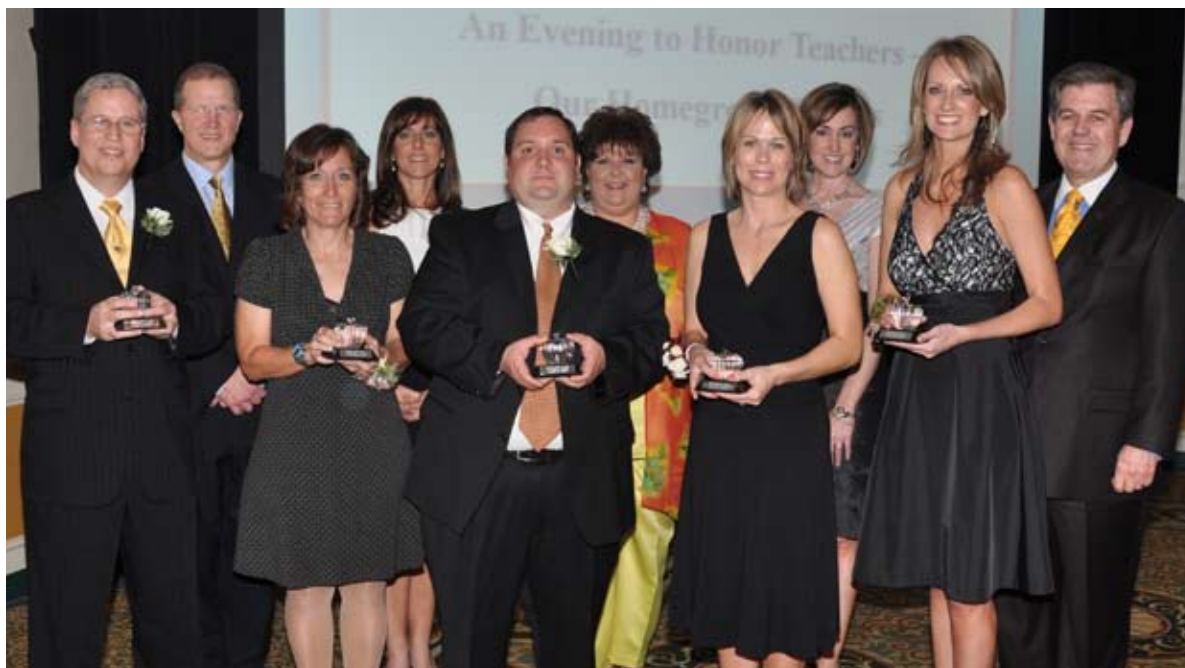
2008 Crystal Award winners, event organizers and sponsors

Exceptional teachers find innovative ways to enhance their students' education. So it is fitting that SBEF's annual Crystal Awards Gala recognizes outstanding Gulf Coast-area teachers while raising funds to enhance education for SBISD students.