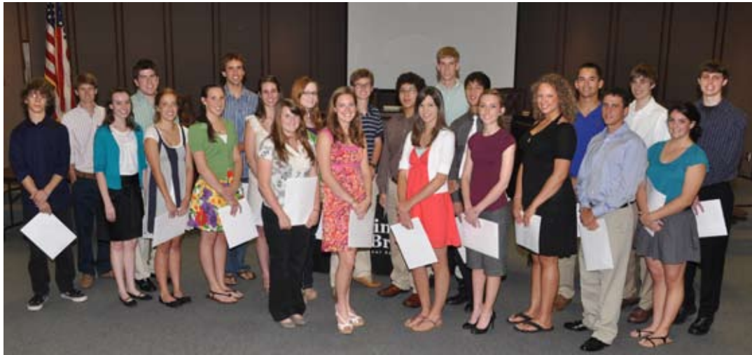
Twenty-seven SBISD grads, children of SBISD employees, received scholarships from the SBEF-sponsored Employee Campaign. The Campaign saw a 400 percent increase in participation in 2008-2009!