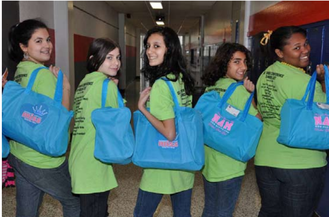
Seventh-grade girls across the district – and their moms – enjoyed a day-long Girl Power Conference. They learned positive alternatives to challenging issues.