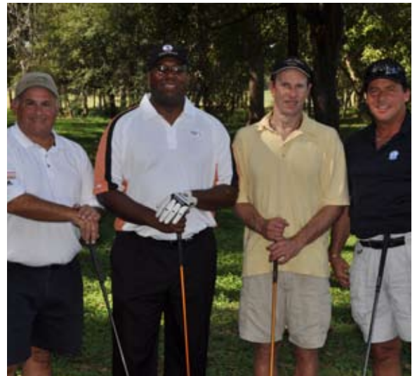
The team from Perdue, Brandon, Fielder, Collins & Mott, L.L.P., 2008 Eagle Clubhouse Sponsor