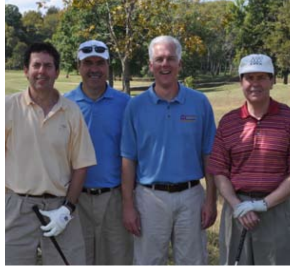
Team Apache Corporation, 2008 Golf Shirt Sponsor

Register at www.springbranchisd.com/sbef