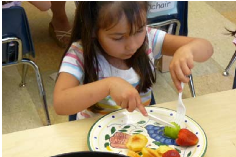
Teachers at Panda Path Pre-K used a J. Landon Short Mini-Grant to teach nutrition as part of a Picturing Our Own Cooking Books project.