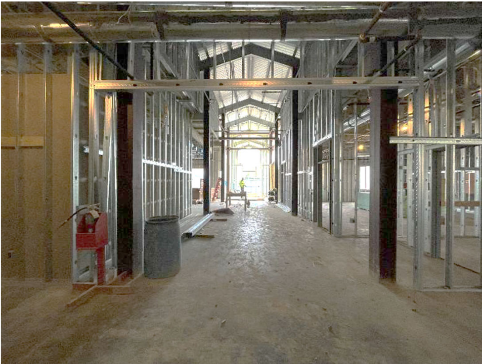
View from main corridor to the front entrance