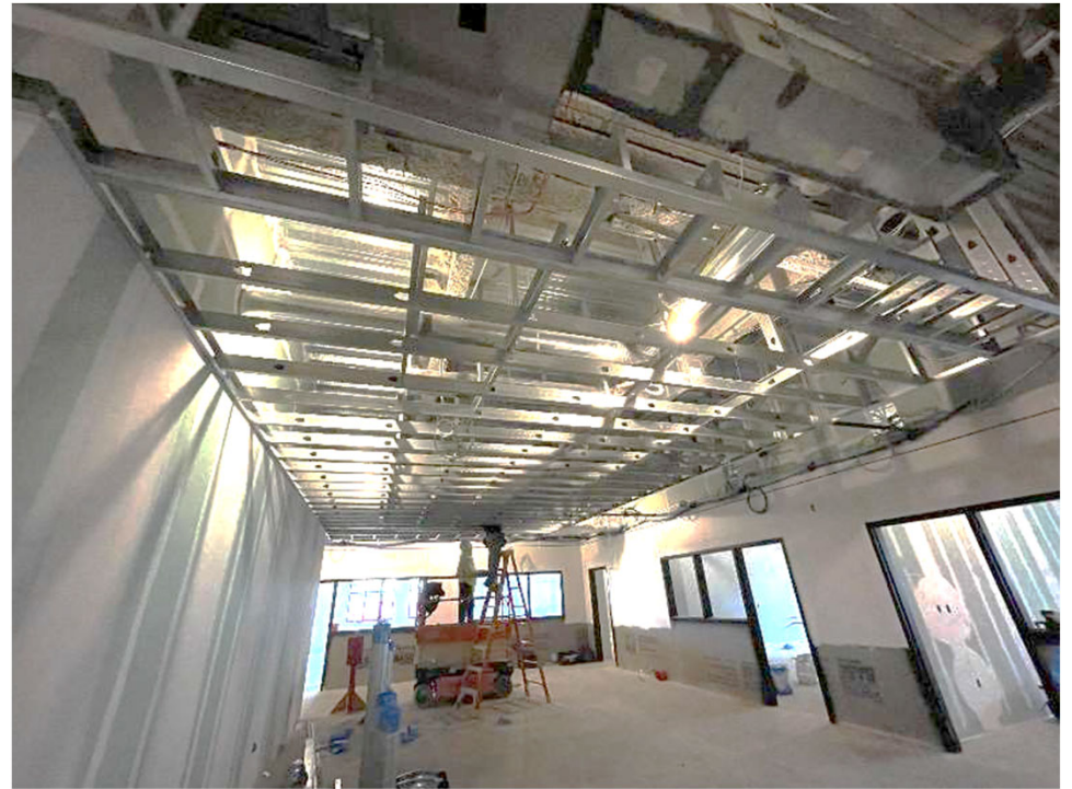
Flex area at 1st floor classroom wing