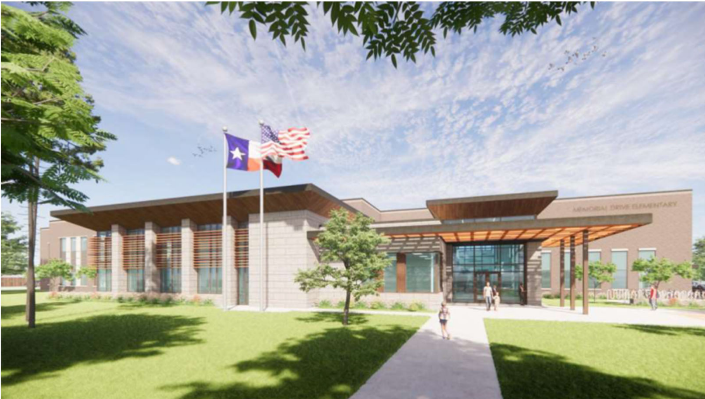
Rendering - Front entry