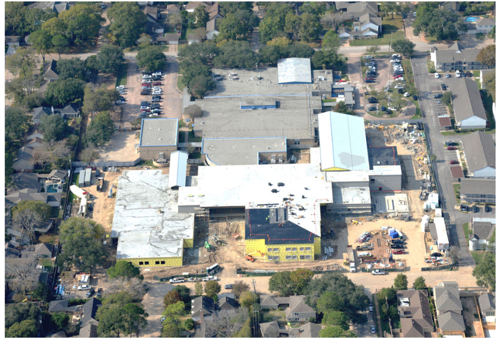
Aerial view as of December 2022