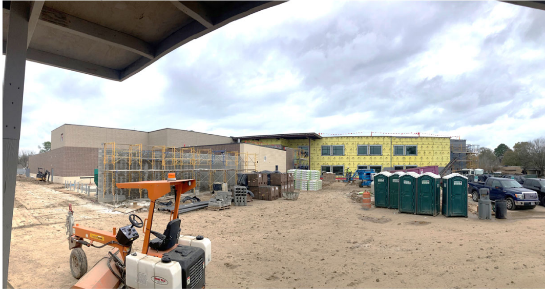
Bus loop area