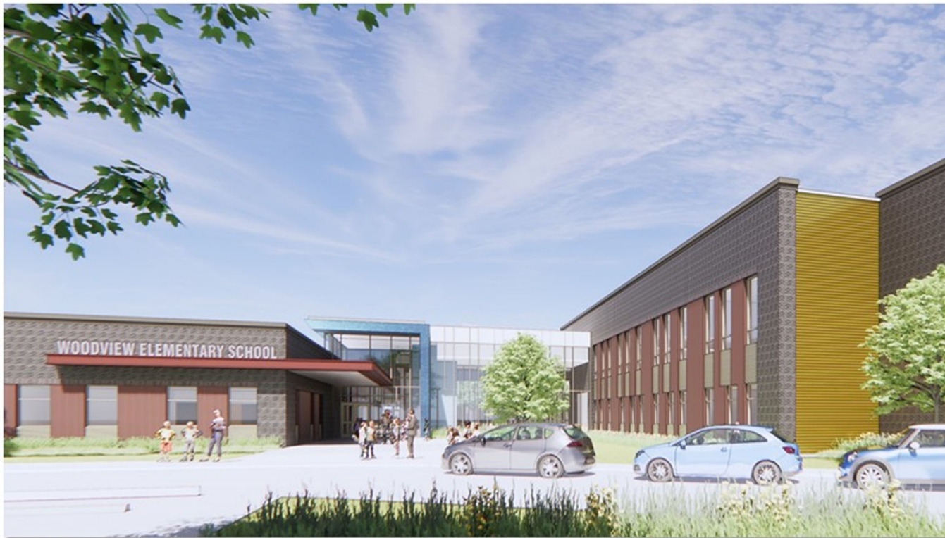
Rendering - Front entry