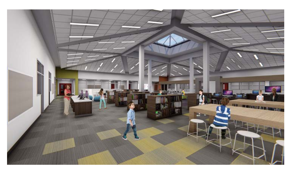
View of Renovated School Library