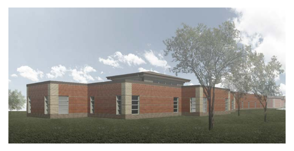
New Classroom Wing Addition