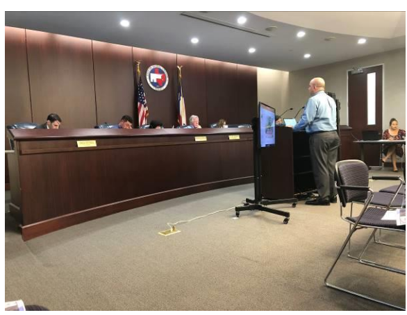
City of Hedwig Village P&Z Presentation Update