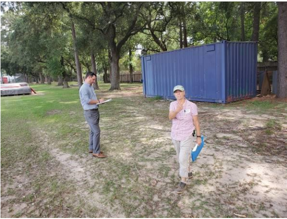
Tree review with the City of Hedwig Village