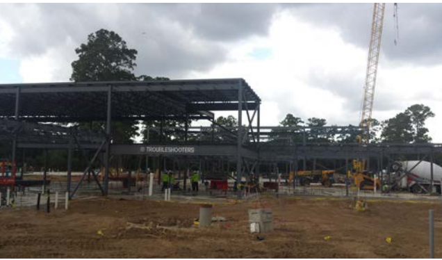
Steel Erecting Progress (Area 'E' & 'F')