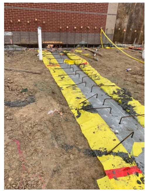
Exterior Grade Beams Poured at New Addition