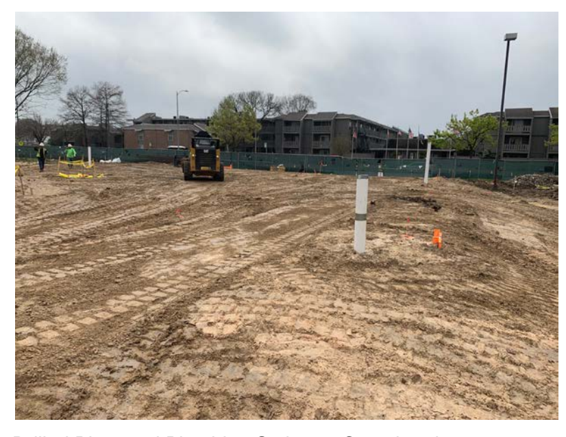
Drilled Piers and Plumbing Stub-ups Completed