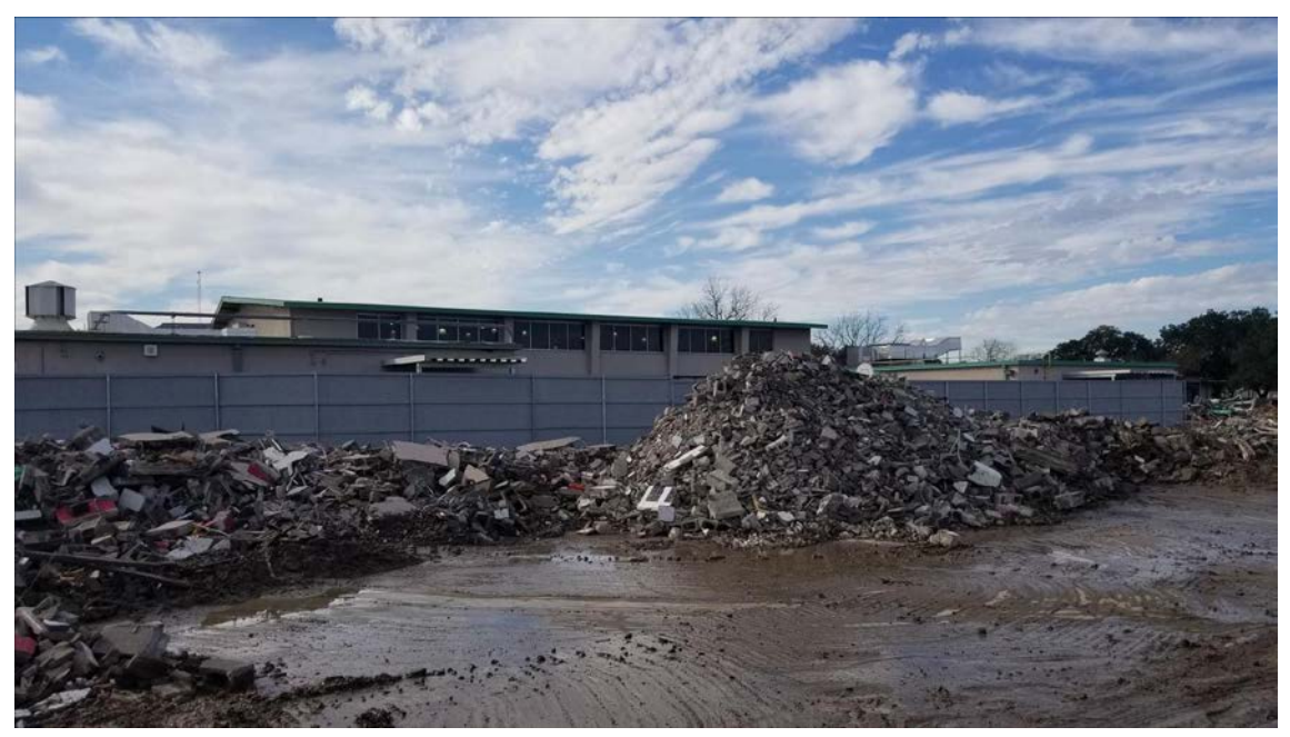
Demolition of Gymnasium complete.