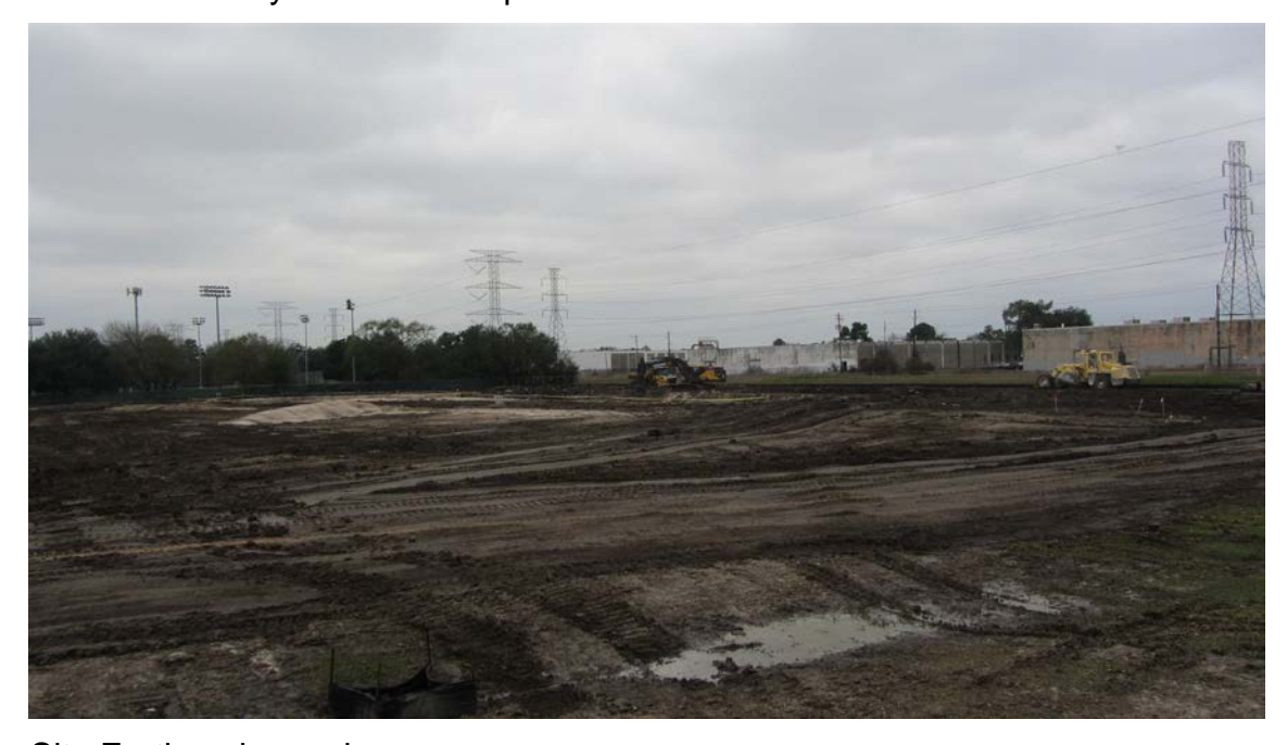
Site Earthwork ongoing.