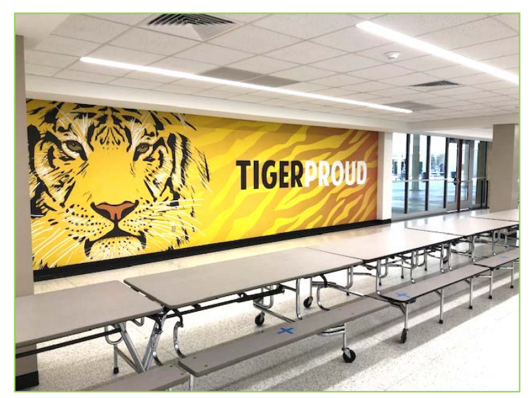
Tiger graphic installed in the cafeteria.