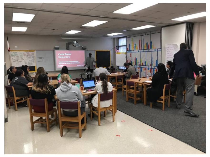
Kick-off of PAT Meeting #1 Presentation