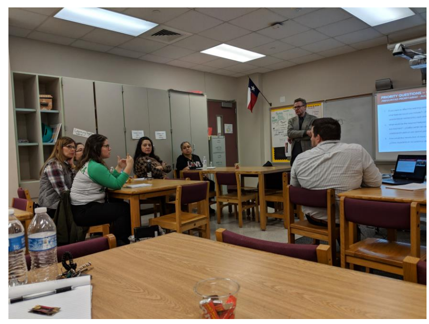
Review of Fact-Finding Information