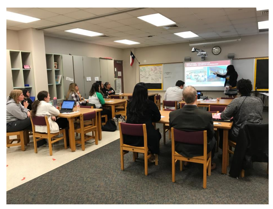
Review of SBISD Design Standards