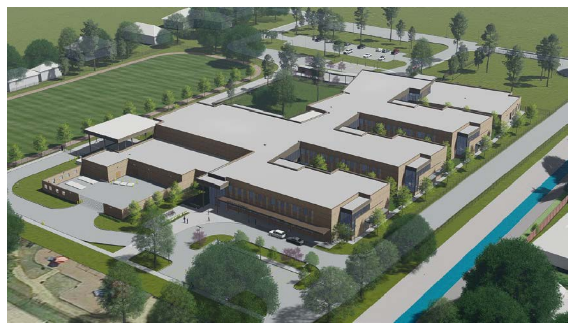
Aerial Rendering from North