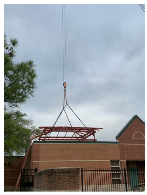
Installing Structural Framing for Pop-ups