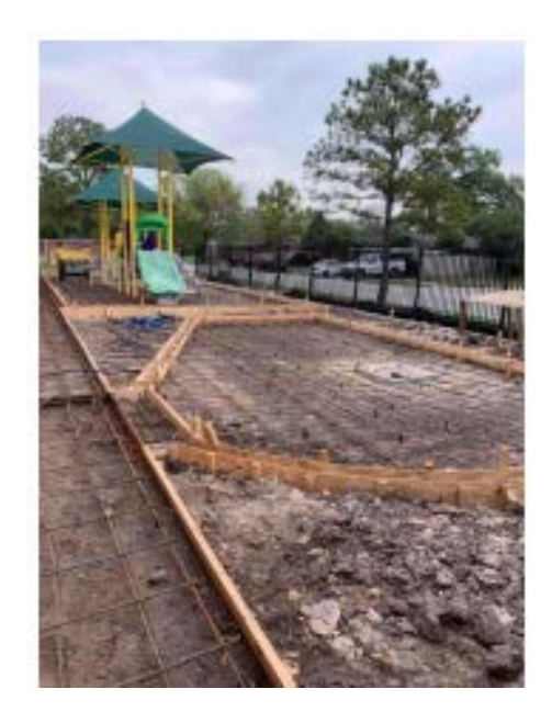
Formwork at new playground surfaces