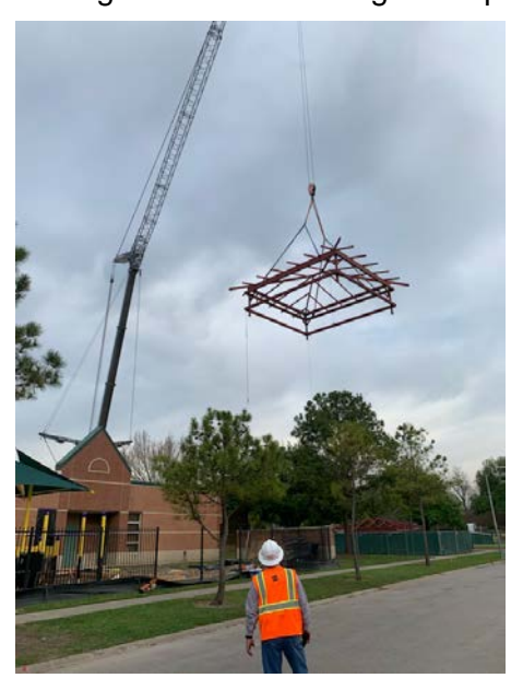
Installing Structural Framing for Pop-ups