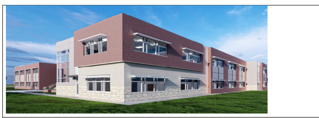
Proposed elevations of classroom addition.