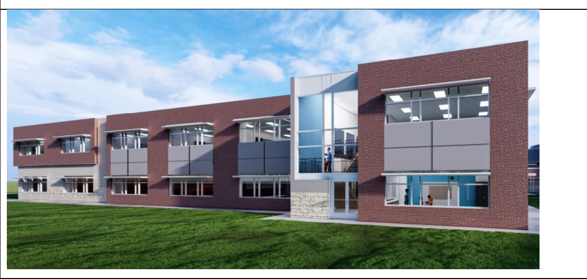
Proposed elevations of classroom addition.