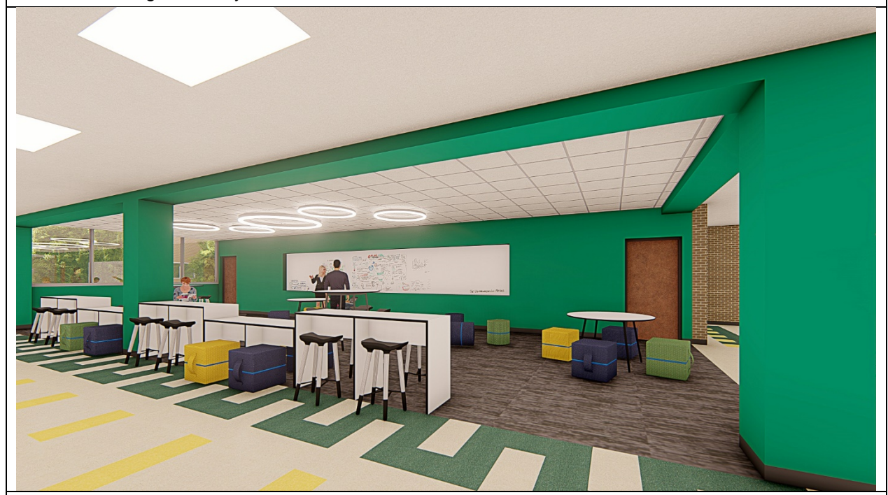
Schematic Design of a Collaboration Area