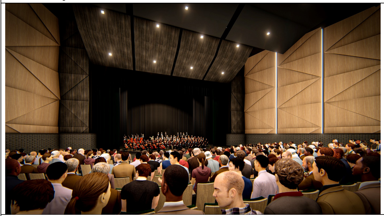
Schematic Design of Auditorium