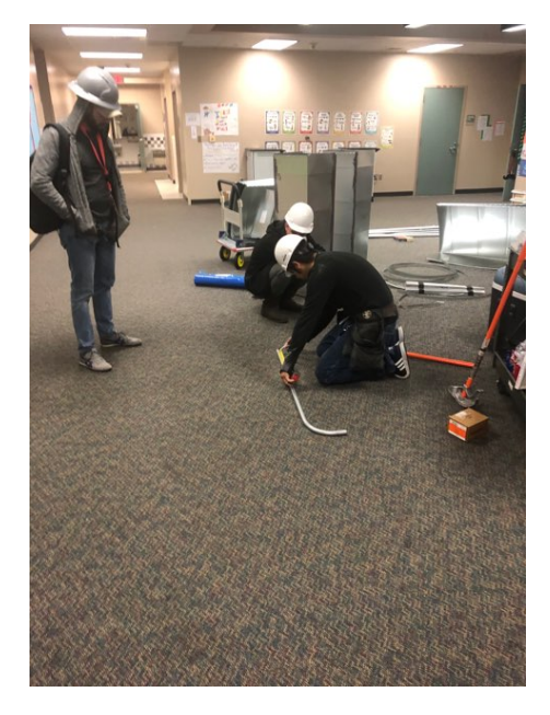
Preparation for electrical above ceiling work