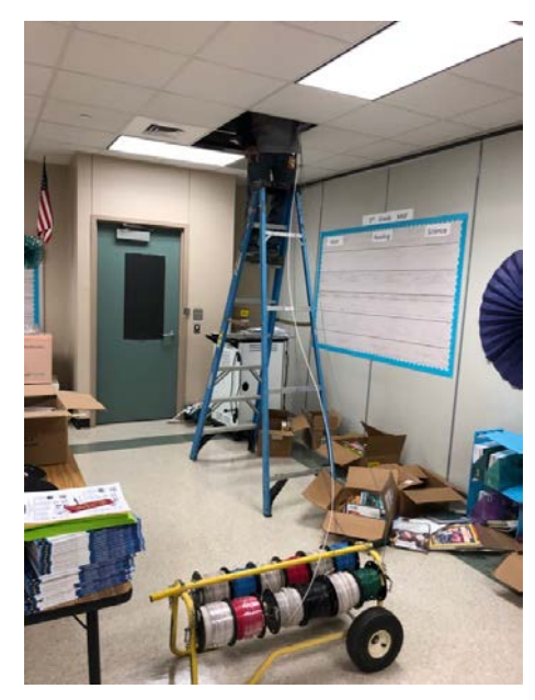
After hours work in progress.