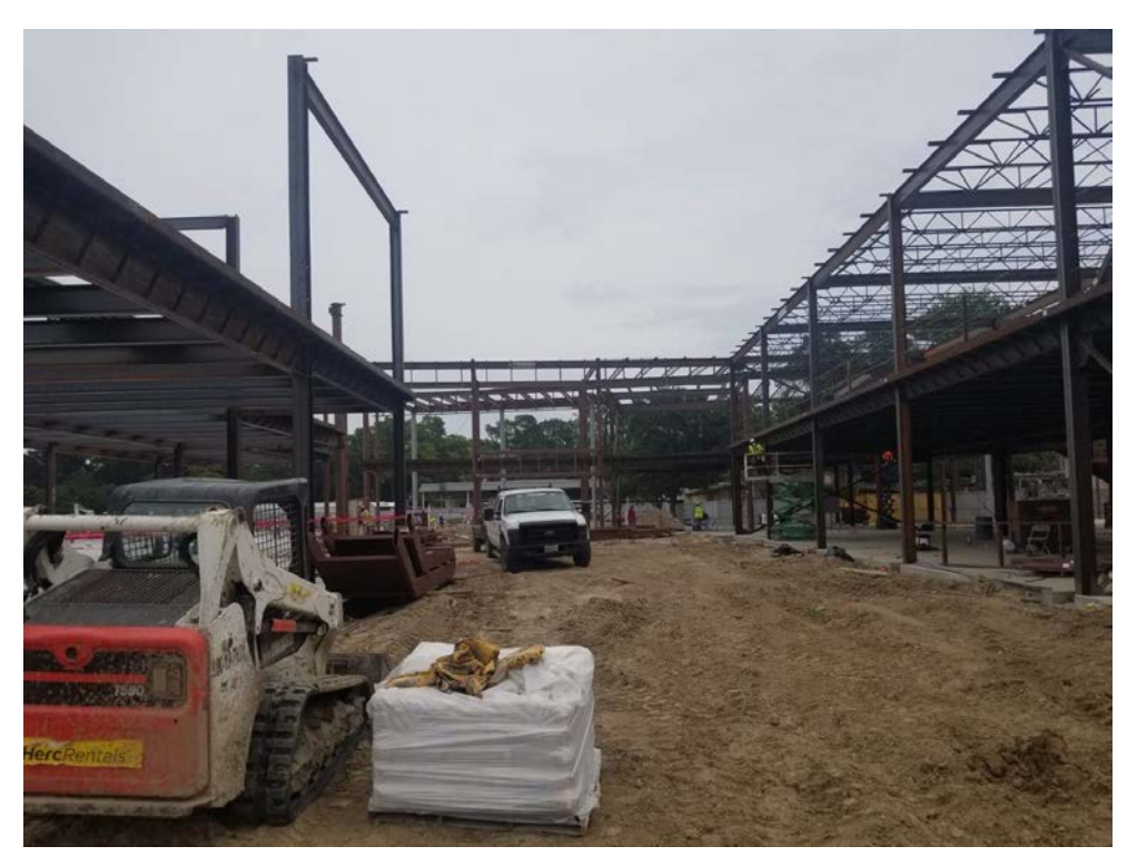
Area B and C Courtyard