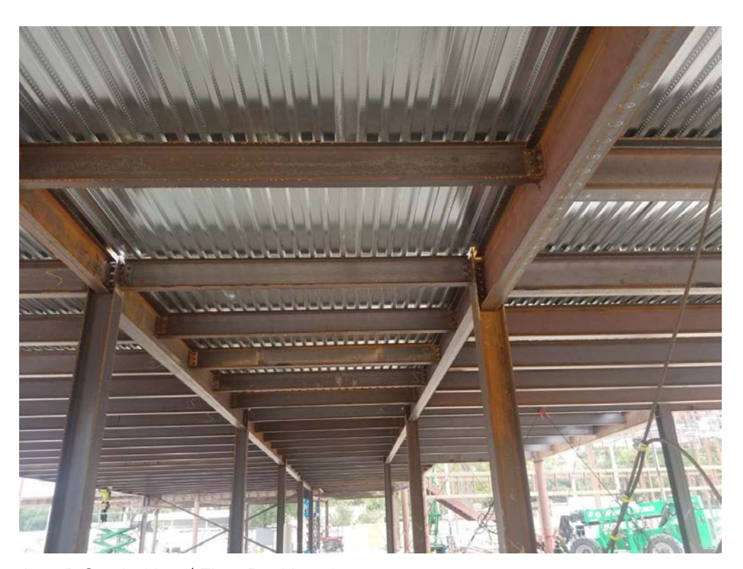
Area B Steel with 2<sup>nd</sup> Floor Decking above