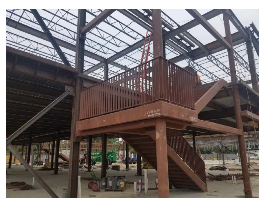
Area B West Stair 2017 SBISD Bond Bunker Hill Elementary School