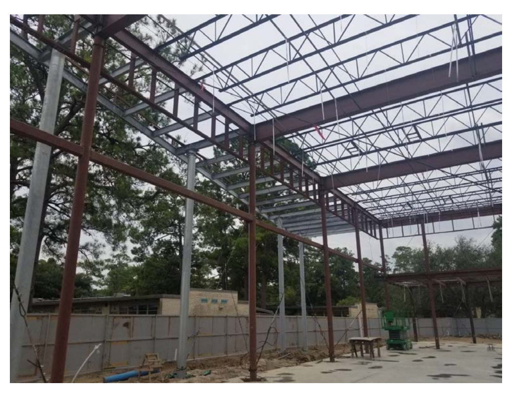
Library Interior looking out to courtyard