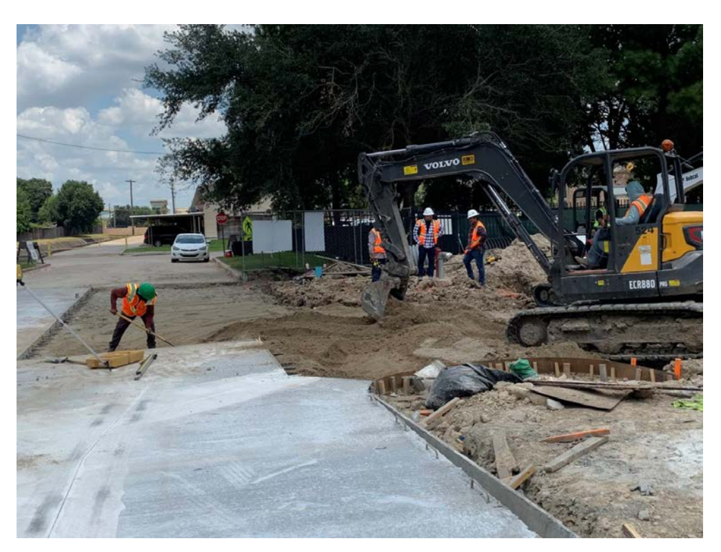
Completing West Parent Drive