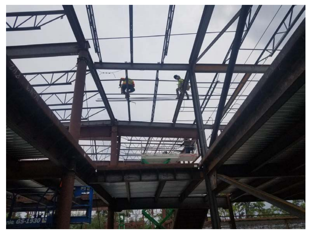
Roof Joist Installation