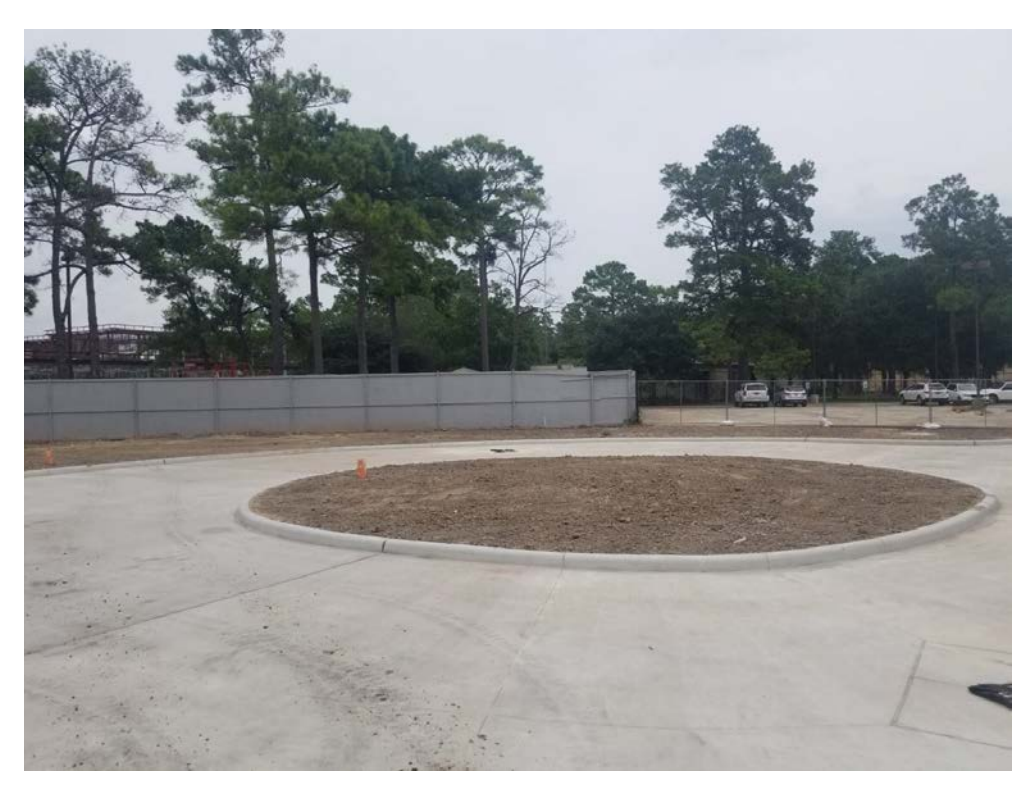
Parent Drive Roundabout