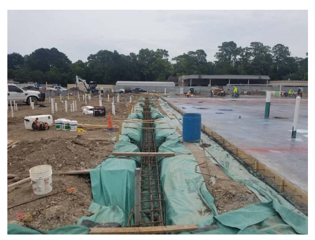
Area E Grade Beam Reinforcing 2017 SBISD Bond Bunker Hill Elementary School