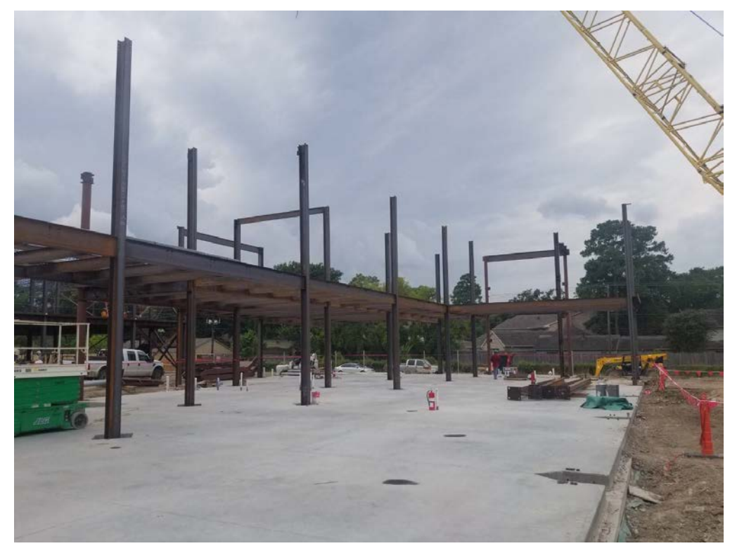
Slab and Steel Area C