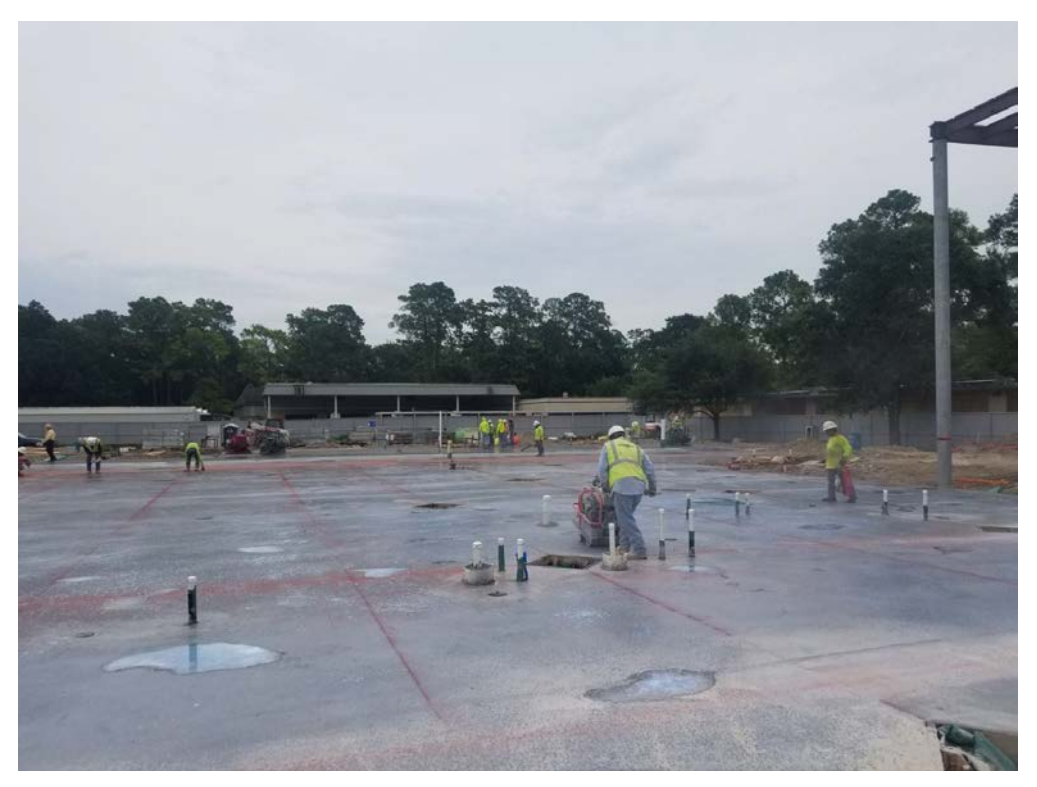
Area F Slab Poured