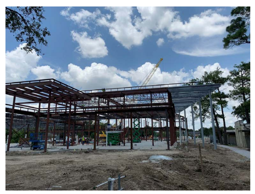
Steel at Main Entry