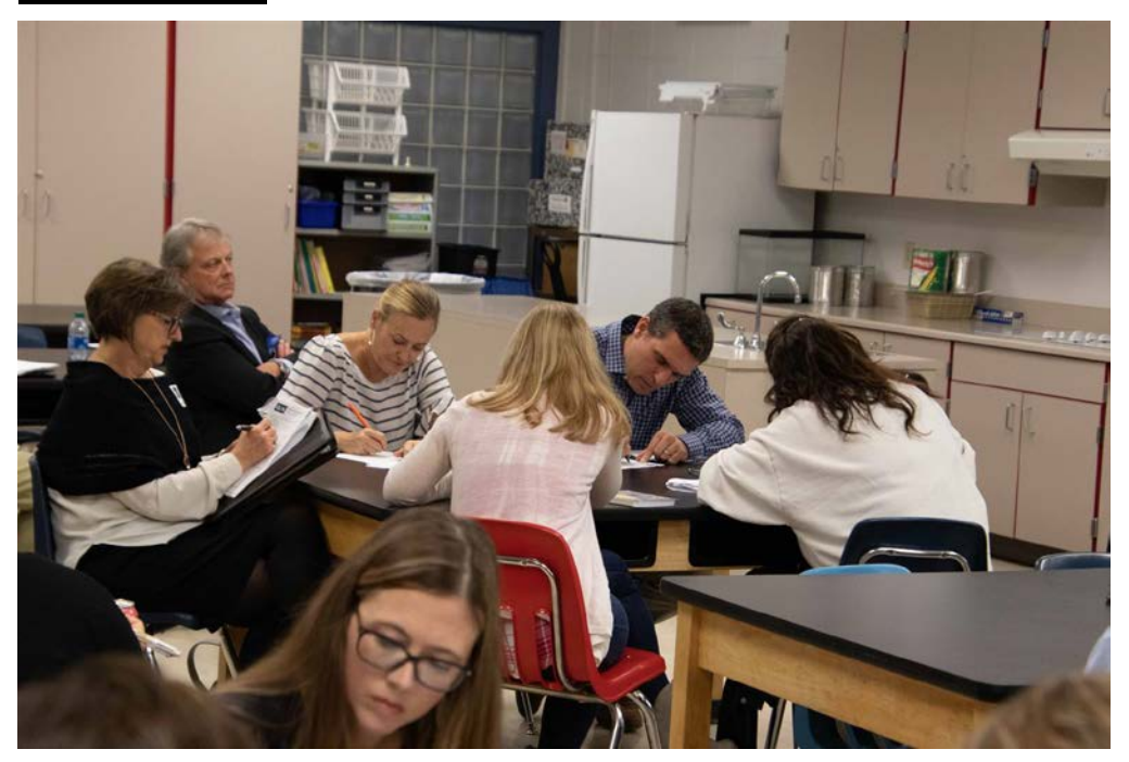
PAT Meeting #1: PAT members write out their responses to visioning questions exercise.