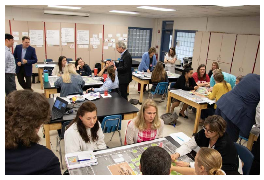
PAT Meeting #1: PAT members take part in the site diagramming exercise.