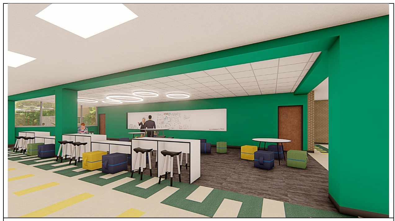
Schematic Design of a Collaboration Area