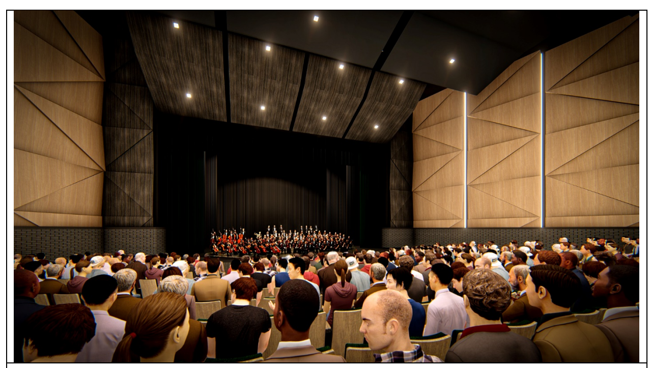
Schematic Design of Auditorium