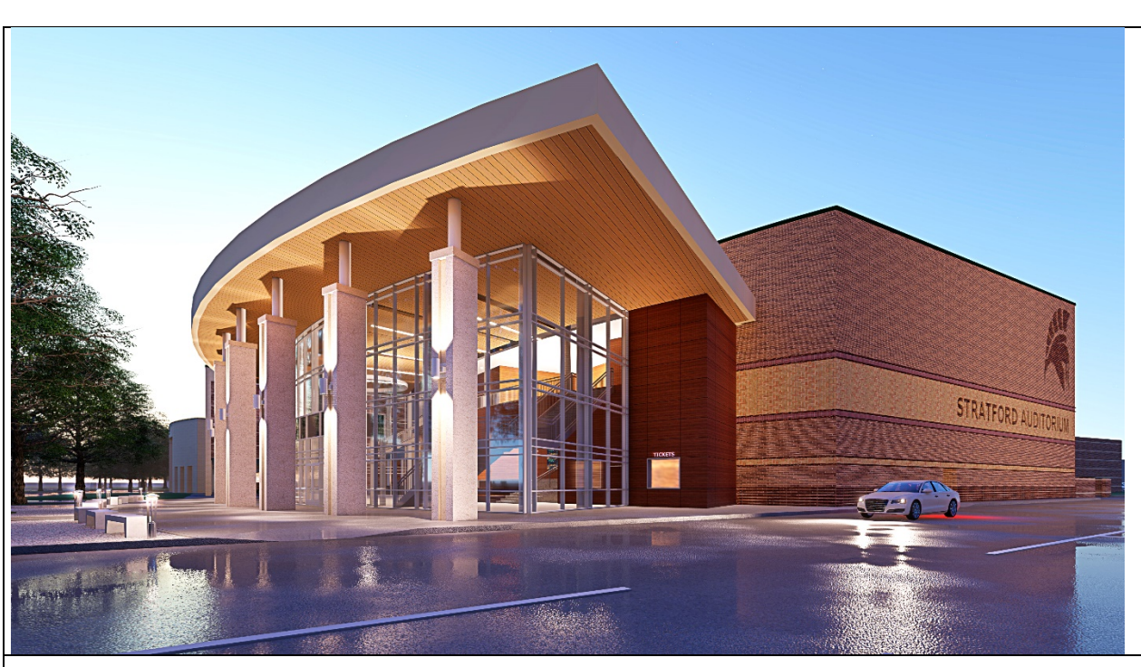
Schematic Design of Exterior.