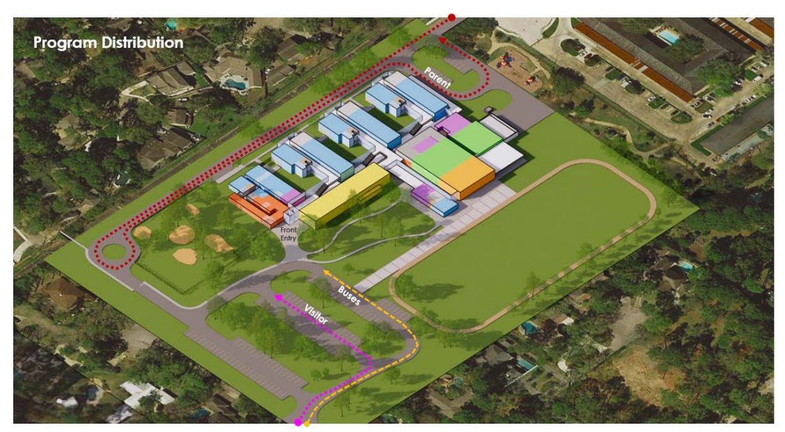
3D Massing Diagram: Traffic Patterns

Conceptual Imagery as presented to PAT Meeting #3