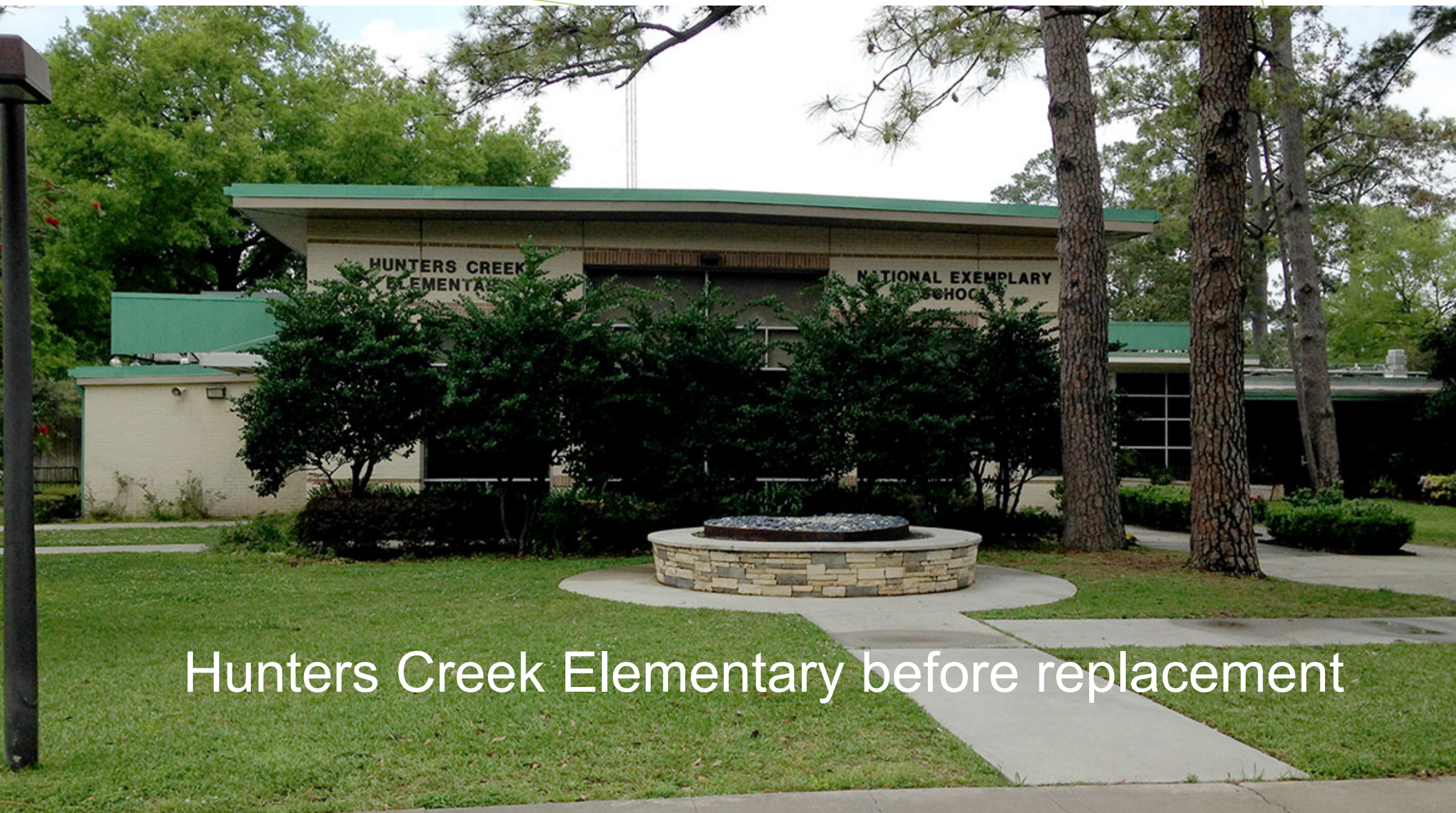
Hunters Creek Elementary before replacement