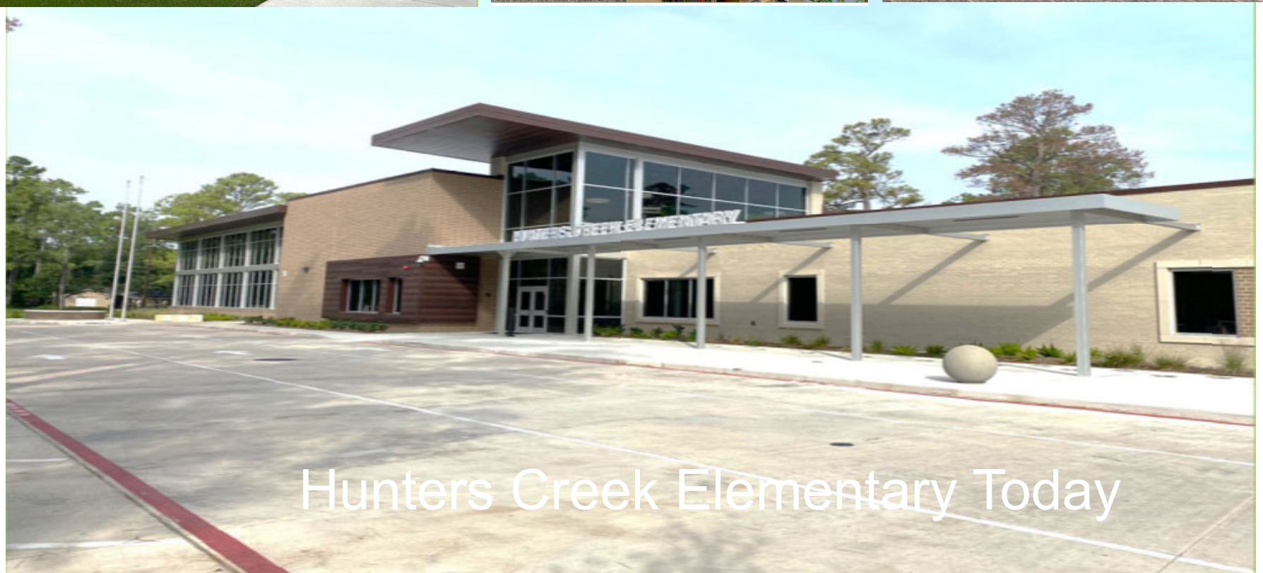
Hunters Creek Elementary Today