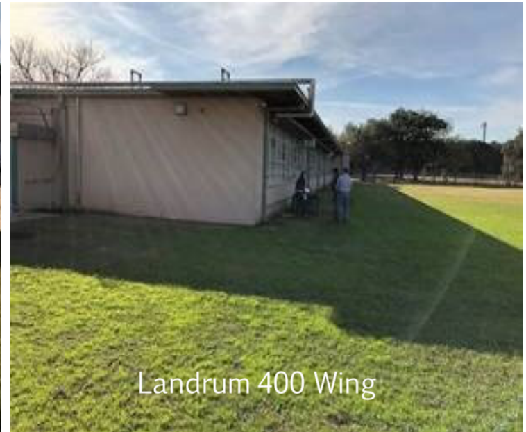
Landrum 400 Wing

Landrum Middle School before replacement