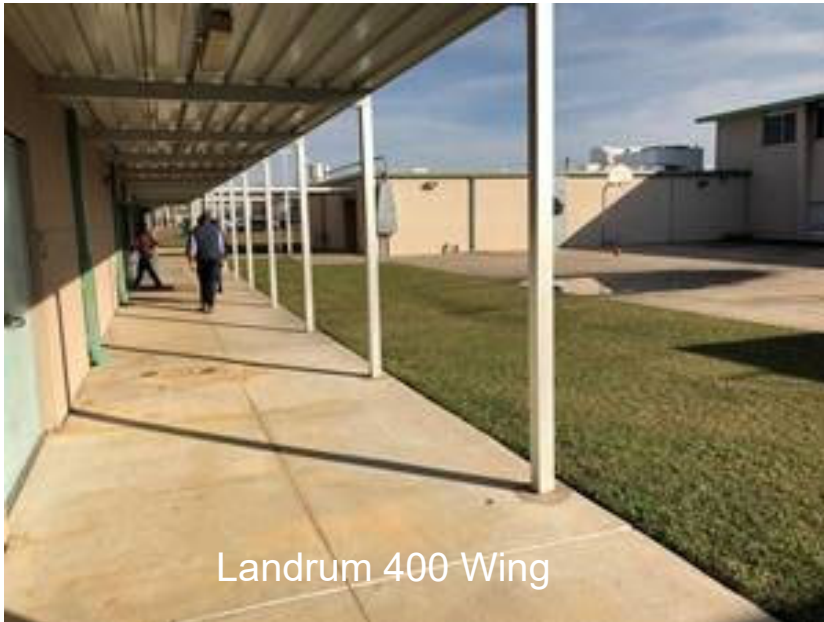
Landrum 400 Wing