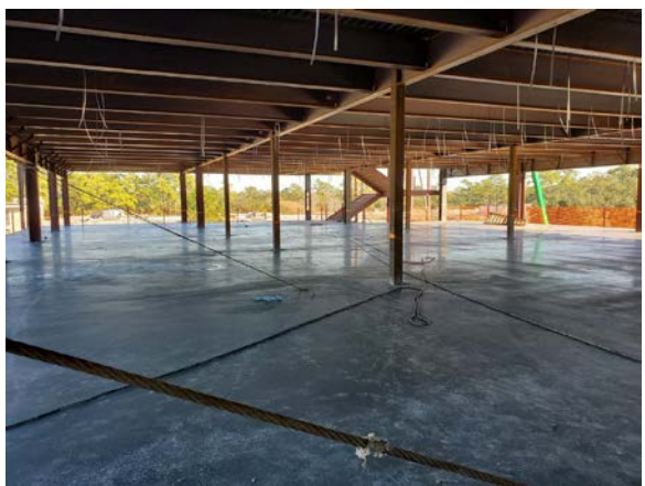
Area NC3 deck poured