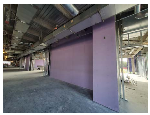
Area NA3 drywall at science labs