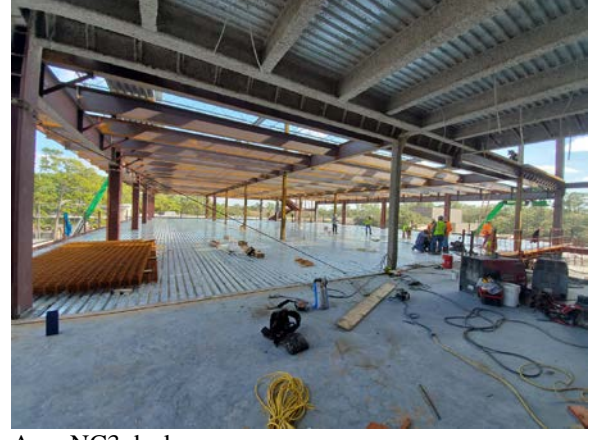
Area NC3 deck pour prep