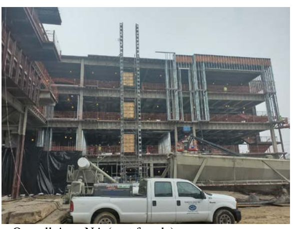
Overall Area NA (east façade)