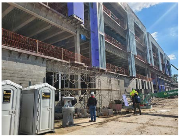
CMU work in area NA1