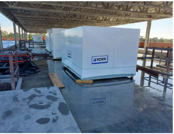
Mechanical enclosure with equipment