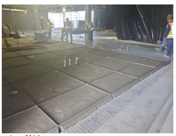
Area NA1 terrazzo at servery