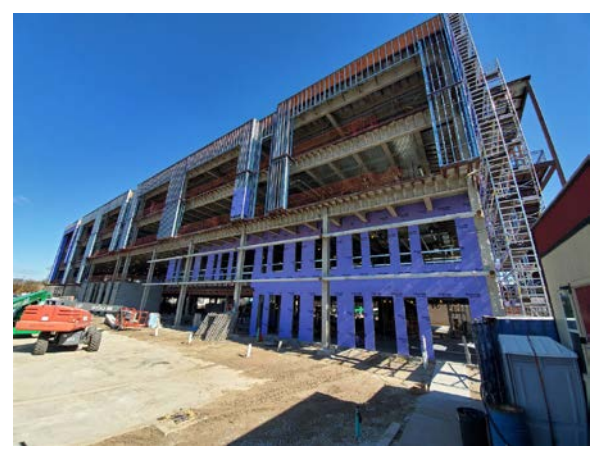
Exterior west façade