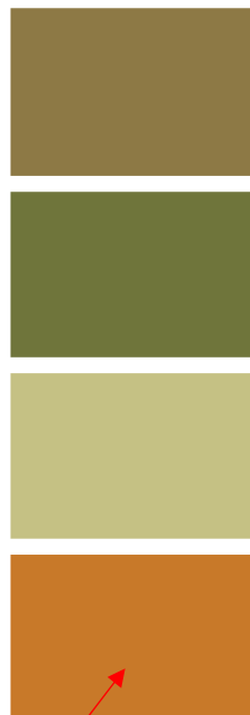
INTERIOR COLOR PALETTE A