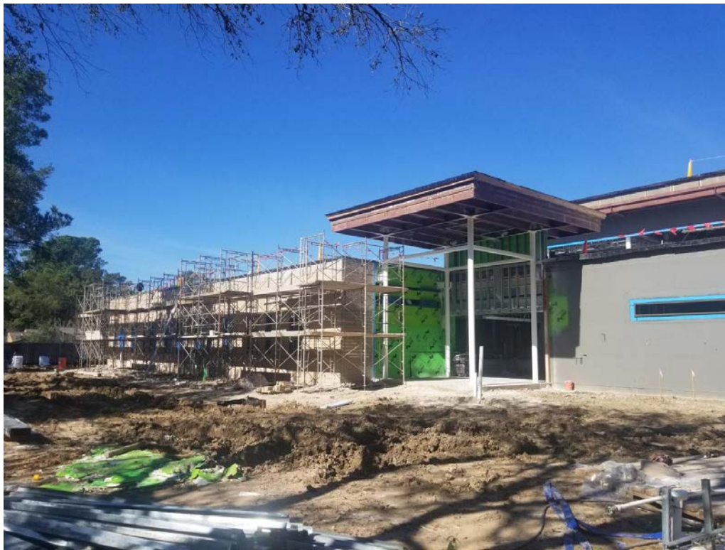
Main Entry with Brick Install ongoing