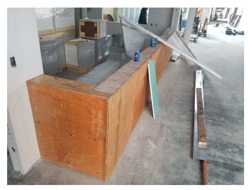
Reception Desk Framing