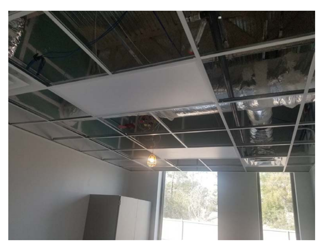
Ceiling Grid Install