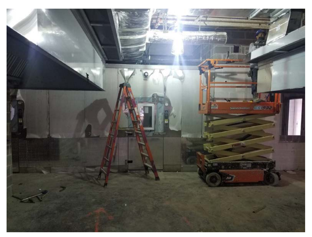
Kitchen Hoods and Walk Ins