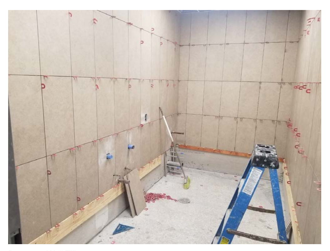
Restroom Wall Tiling