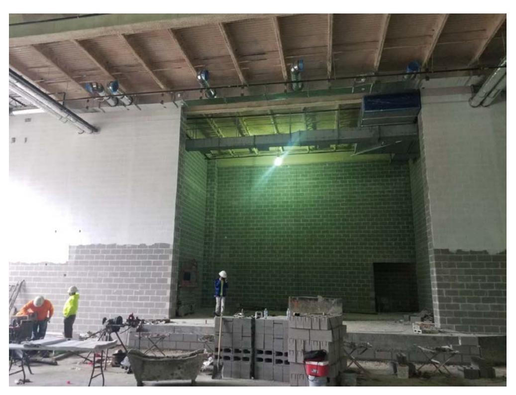
Stage at Dining