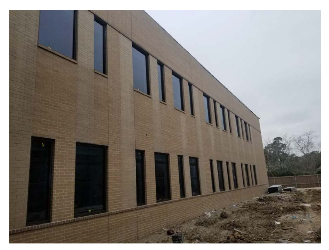
Classroom Wing Exterior Wall