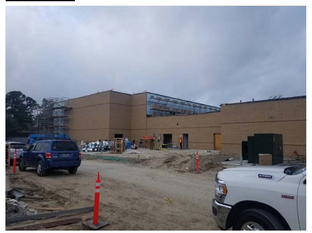
Brick at Gym and Area E East Façade